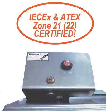
MiniPurge DP back plate