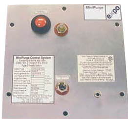
MiniPurge DP panel mount

Y-Pressurizing Class II Division 1 Group F & G